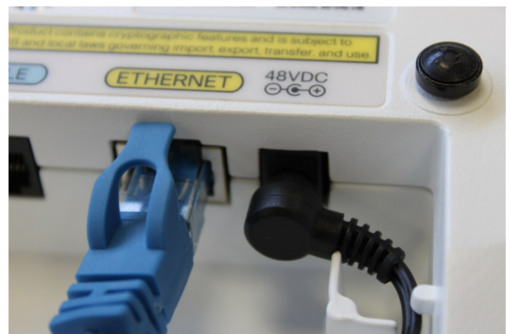
Connect Power Cable