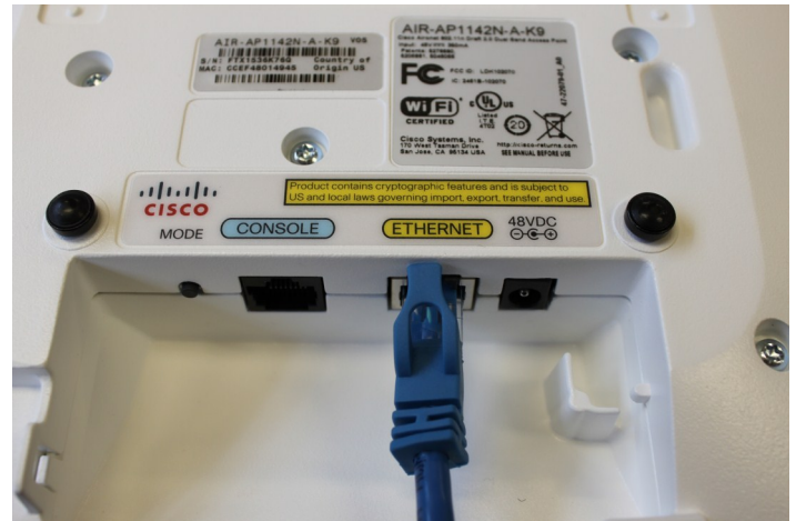
Plug in Ethernet cable

8) Wait 2 minutes for Network to be Ready